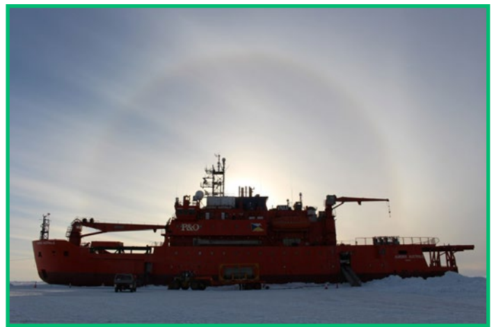
For CAPE-K, ARM will deploy components of the second ARM Mobile Facility, which operated on a research vessel that traveled across the Southern Ocean between Tasmania and Antarctica in 2017 and 2018.

Using an ARM Mobile Facility (AMF). Mobile facility deployments are determined through a user proposal process. An AMF can be deployed for stand-alone campaigns or for collaboration with interagency experiments. Scientists interested in using an AMF are encouraged to submit proposals at the following web page: https://www.arm.gov/research/campaign-proposal .