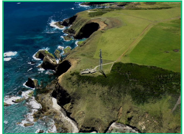
From April 2024 to September 2025, ARM plans to conduct the CAPE-K campaign at the Kennaook/Cape Grim Baseline Air Pollution Station in Tasmania.

The station is jointly managed by the Australian Bureau of Meteorology (BOM) and Commonwealth Scientific and Industrial Research Organisation (CSIRO). Established in 1976, this station has produced the longest and most consequential record of aerosol and gas-phase chemistry in the Southern Hemisphere. However, extensive cloud and precipitation measurements have not been collected there.