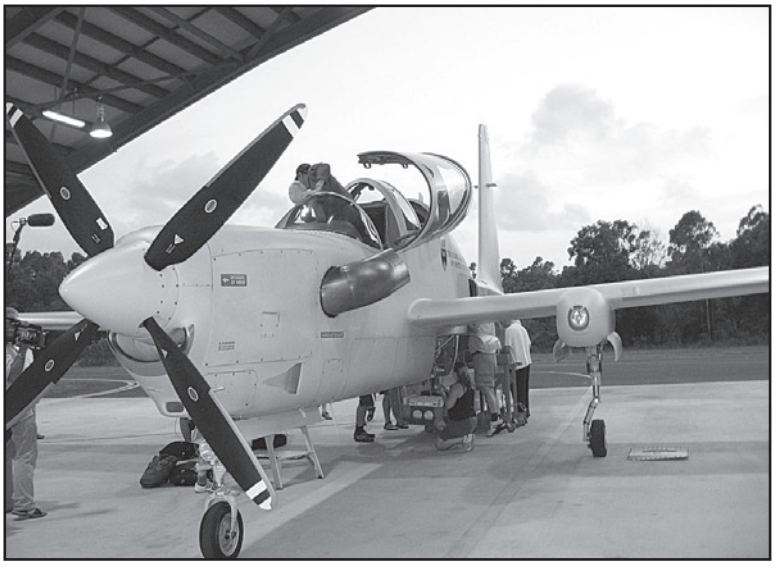
CROWDS GATHER AT THE LOCAL FIELD DAY

I've visited all the sites and shown the sonde data in relation to everything else. Everyone was very excited to see how their efforts are contributing to the experiment. Spirits remain high and they are committed to what they're doing; I think we owe special thanks to retirees at the sonde sites who are keep things running smoothly, both technically and on a personal level.